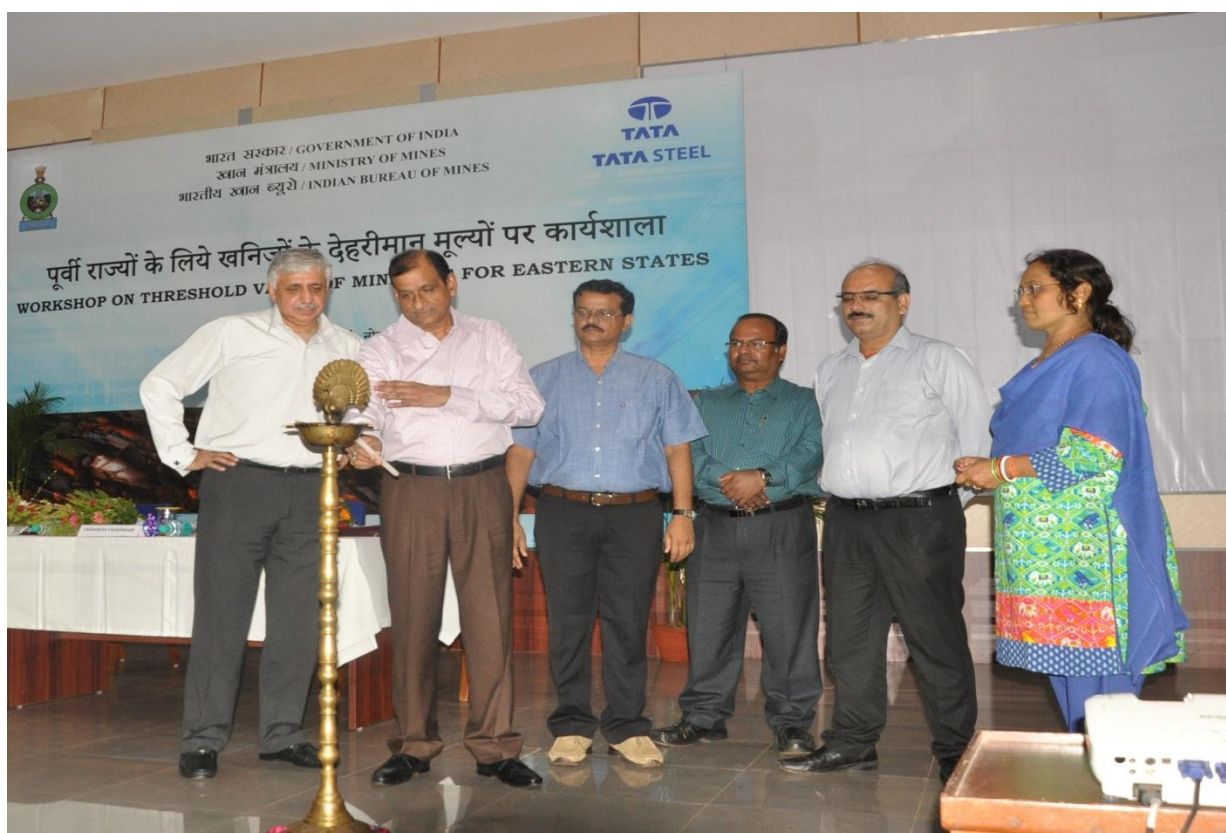
Lightening the lamp by the Guests